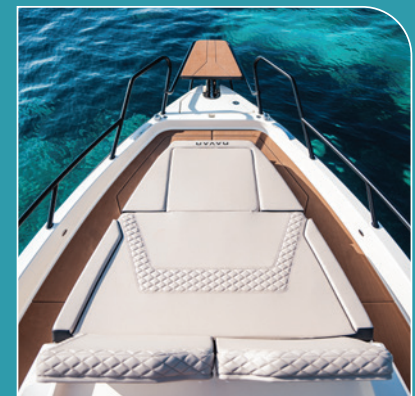
Large bow sun lounge