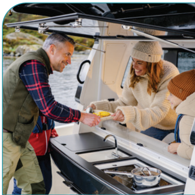
Fully equipped prep station