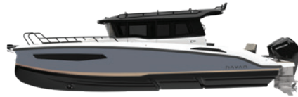
Ashland Grey upgrade