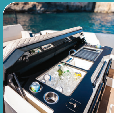
Unique pivoting cockpit seating