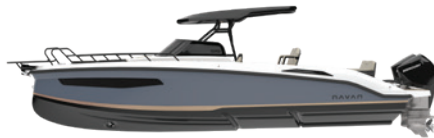
Ashland Grey upgrade