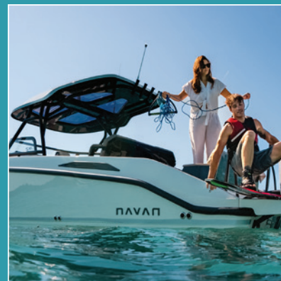
T-top with integrated acrylic window