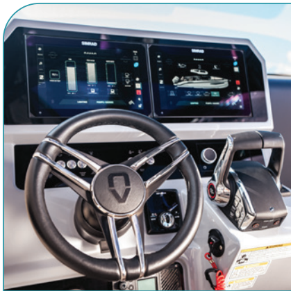
Ergonomic helm w/ digital dashboard up to 12" flushed dual screens