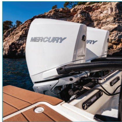
Multiple engine configuration